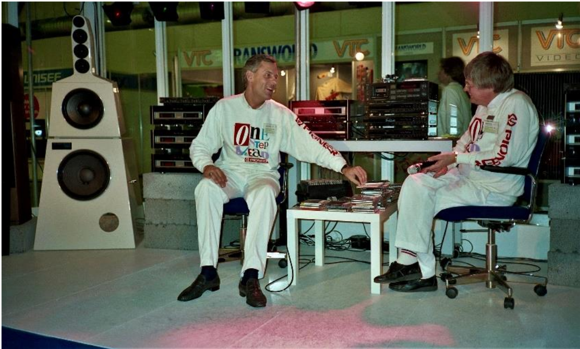
Presentation of the new Pioneer line-up of HiFi products utilising the Pioneer/TAD speakers