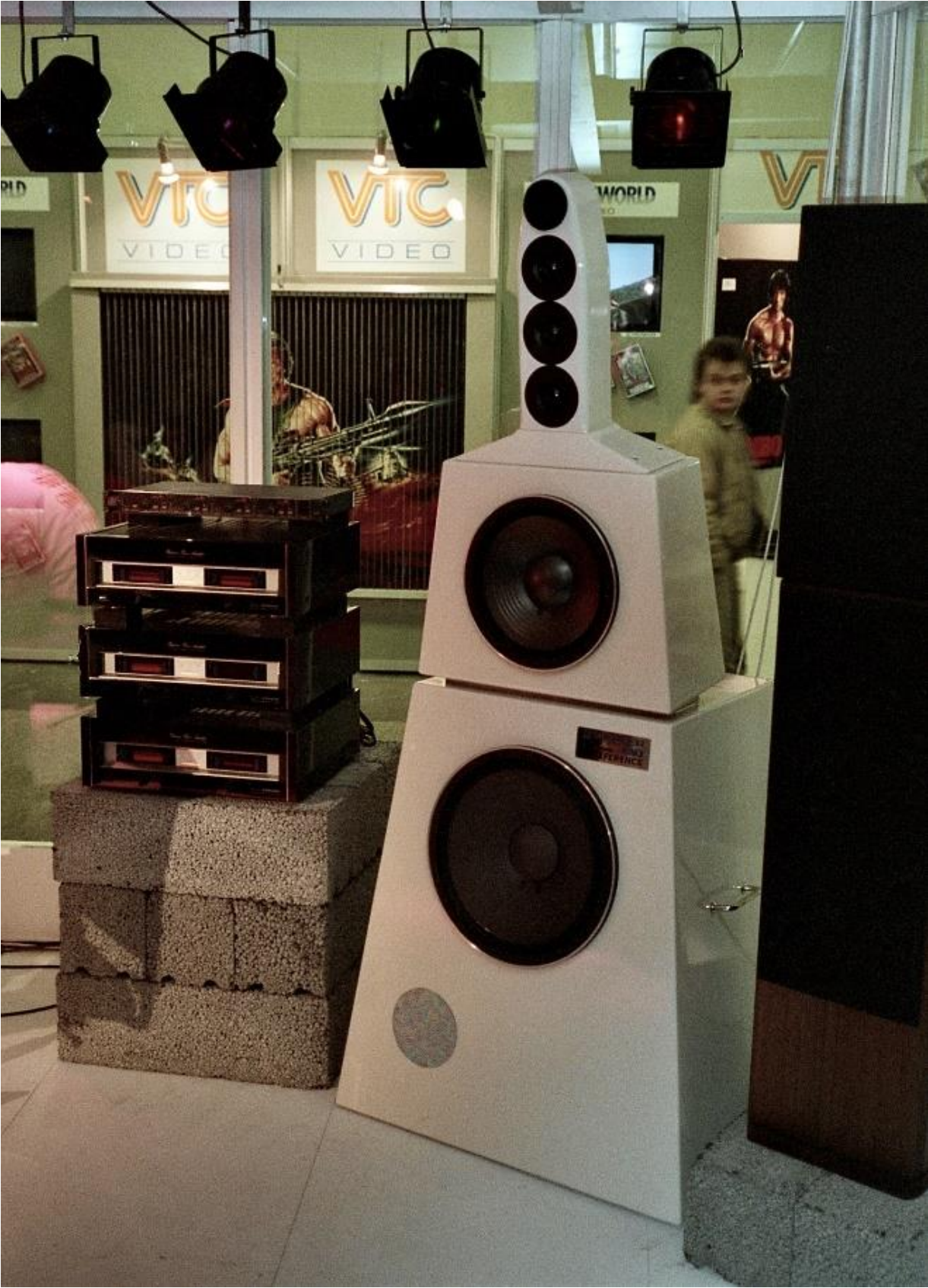
The Pioneer/TAD Swedish Reference on display at a Sound & Vision Exhibition in Stockholm, Sweden