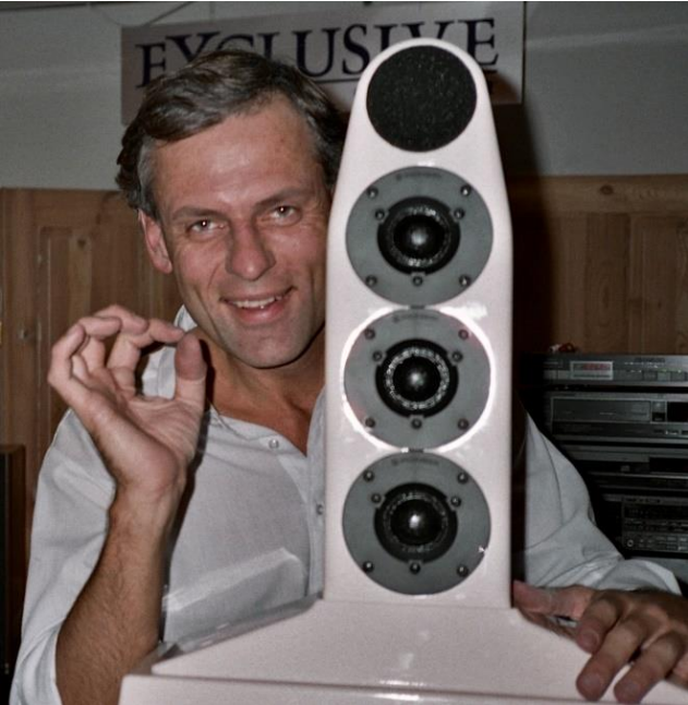
Finetuning the Pioneer/TAD Swedish Reference before display at a Trade Show