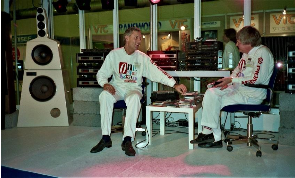
Presentation of the new Pioneer line-up of HiFi products utilising the Pioneer/TAD speakers