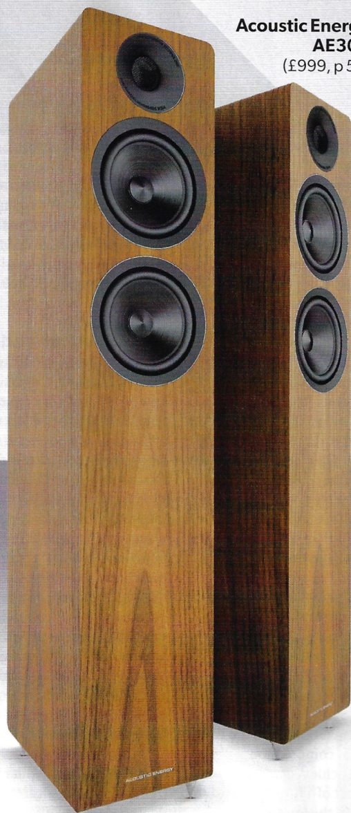
Acoustic Energy AE309 (£999, p 58)

Four talented contestants and a four-figure budget. Each of these performers will play their heart out to win your favour. But there's only ever one winner