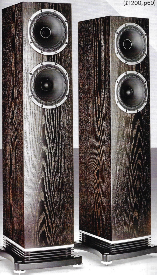
Fyne Audi F501 (£1200, p60)